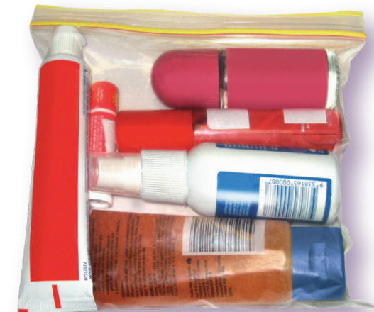
Size about 20 x 20cm

For more information visit www.infrastructure.gov.au